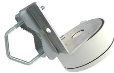
HIK134LE + Z25DV75 + DS-1280ZJ-DM18