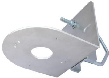
HIK134LE + Z25DV75

professional holder for mounting cameras of HIKVISION, DAHUA, TVT and other brands on a pipe or mast in a vertical or horizontal position