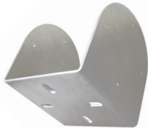
bracket plate HIK120LE TWIN