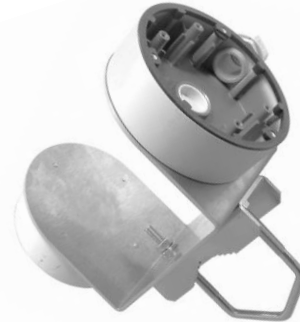
HIK120LE + Z25DV75 TWIN + DS-1280ZJ-DM46 +DS-1260ZJ