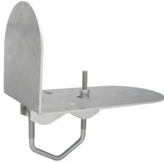
HIK120LE + Z25DV75 TWIN-C

professional bracket for mounting two cameras HIKVISION, DAHUA, TVT and other brands on a pipe or pole in a vertical or horizontal position