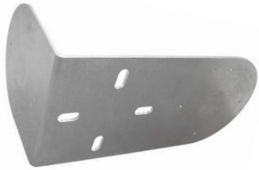
bracket plate HIK120LE TWIN-C