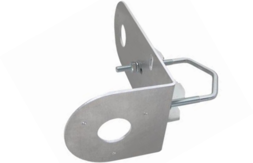
HIK100LE + Z75DV75 TWIN-C

professional bracket for mounting two cameras HIKVISION, DAHUA, TVT and other brands on a pipe or pole in a vertical or horizontal position