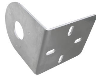
bracket plate HIK100LE