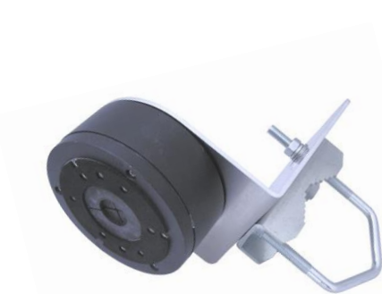
HIK100LE + Z75DV75 + DS-1280ZJ-XS