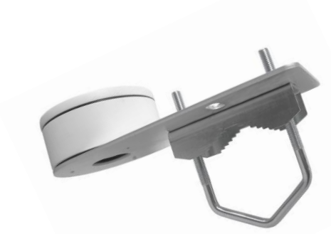
HIK100E + Z75DV75 + DS-1280ZJ-XS

Professional bracket for mounting HIKVISION, TVT, Dahua cameras (or other brands) onto a tube or pole in both vertical and horizontal position